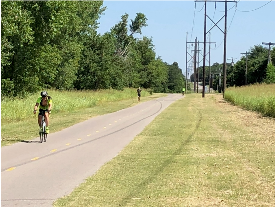
Figure 2: Trail scene

Environmental art, land art, art using recycled or recyclable materials, or art using natural and locally sourced materials is favored, but not strictly required. Art that unfolds through time and space as trail users move through the landscape is particularly encouraged.