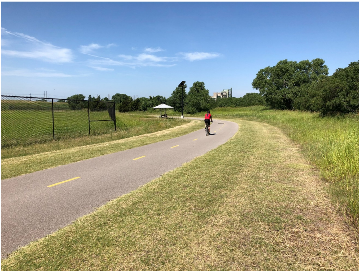
Figure 1: West River Trail scene