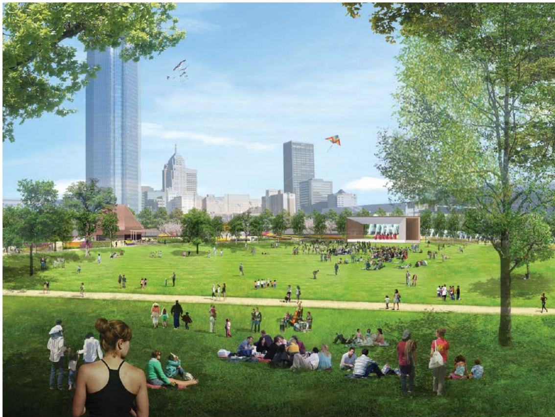
Figure 1: Rendering of Scissortail Park looking from Promontory toward downtown

The City of Oklahoma City announces this call for professional artists to submit their qualifications to be considered for public art that will serve as a dynamic anchoring and threshold feature to Scissortail Park.