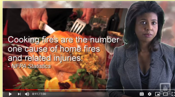
Please click on the above picture for a safe "Thanksgiving"