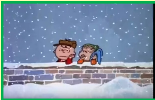
Click on above picture for holiday driving tips.