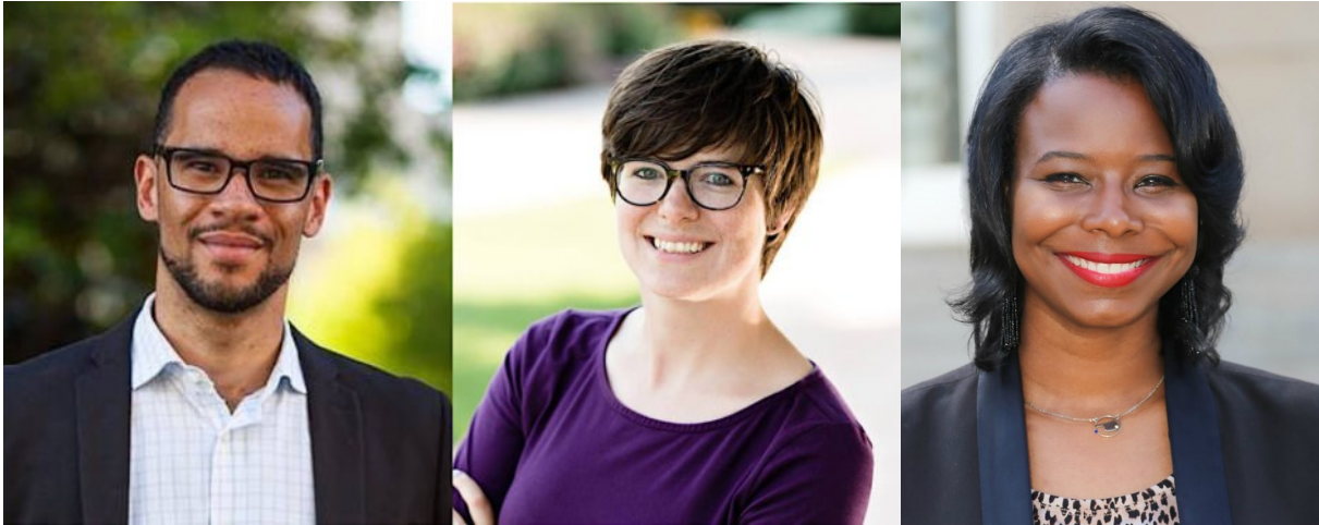
Ward 2 City Councilmember James Cooper, Ward 6 City Councilmember JoBeth Hamon, and Ward 7 City Councilmember Nikki Nice are the newest City Council members