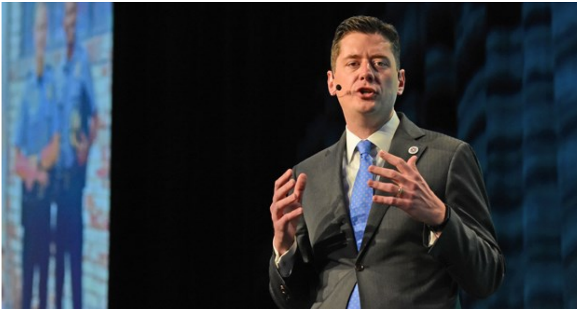
Mayor David Holt delivered his first State of the City address on January 19, 2019