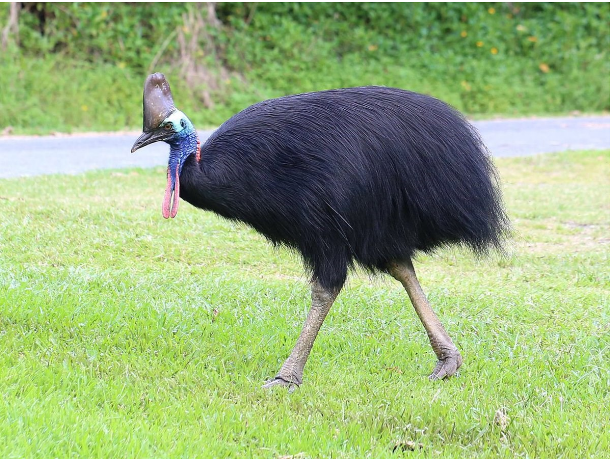
A cassowary, one of the Zoo's new animal additions in Sanctuary Asia.