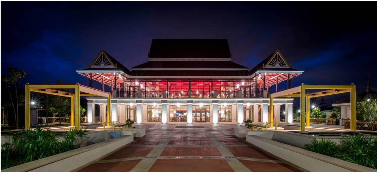
The Lotus Pavilion, located in the Zoo's new Sanctuary Asia expansion.