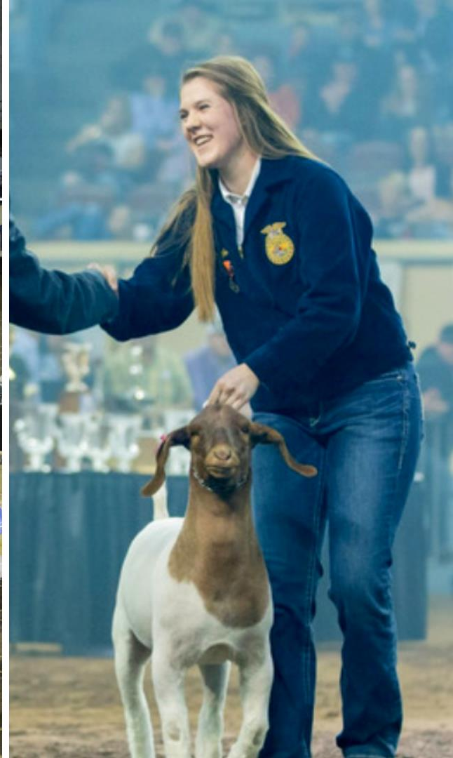
Oklahoma Youth Expo