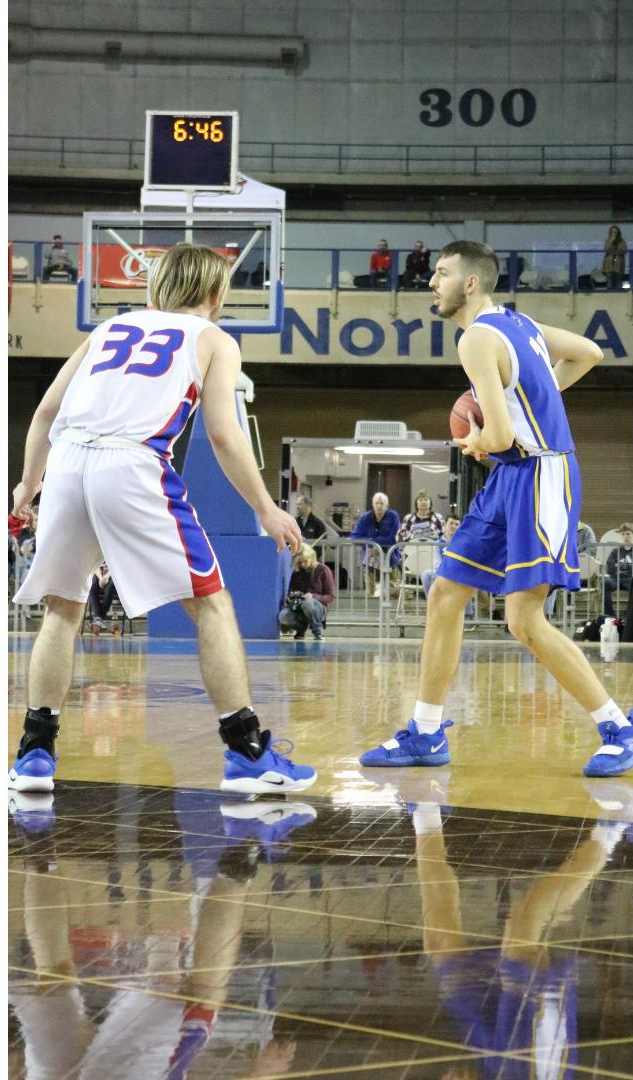
Oklahoma State High School Basketball Championships