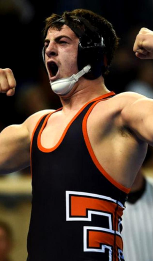
Oklahoma State Junior High and High School Wrestling Championships