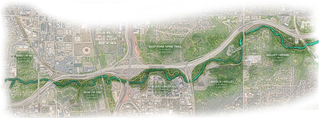
Figure 1: Deep Fork Trail site