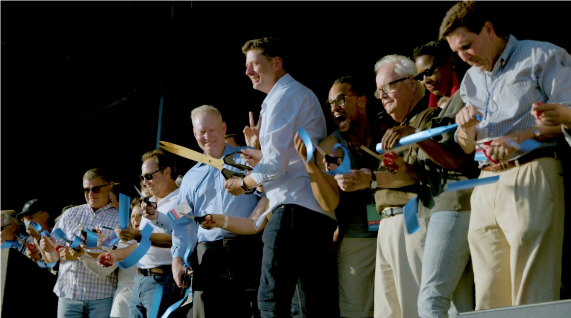
Mayor David Holt, former Mayor Mick Cornett and City Council Members at the ribbon cutting ceremony for the Grand Opening of Scissortail Park on September 27, 2019