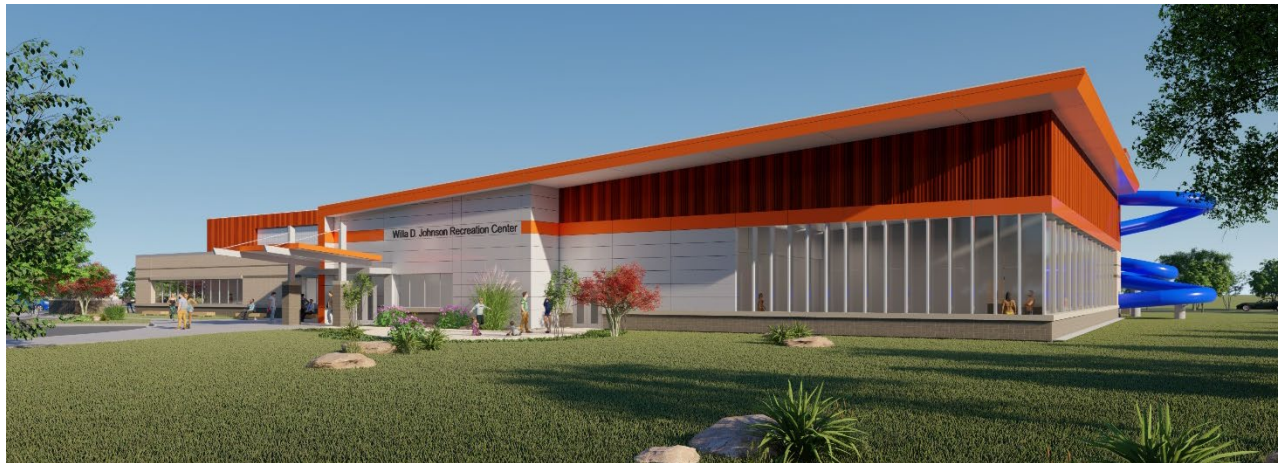
Figure 1: Architectural rendering of Willa D Johnson Recreation Center at Douglass Park

The City of Oklahoma City (City) announces this call to professional artists to submit their qualifications to be considered for a Project to create an interior ceramic mural with the active participation of selected students attending Frederick A. Douglass Middle School and High School.