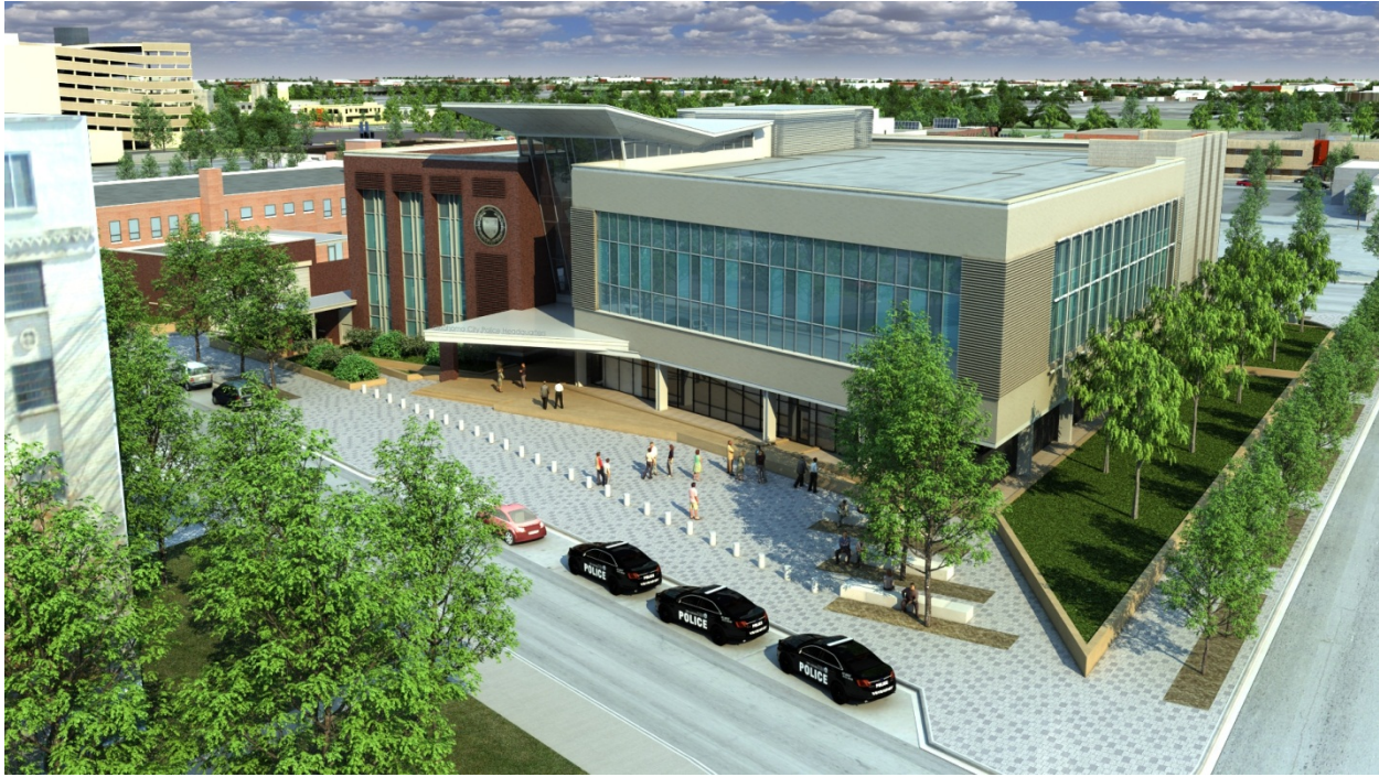
Rendering of the front (north) of Downtown Police Headquarters