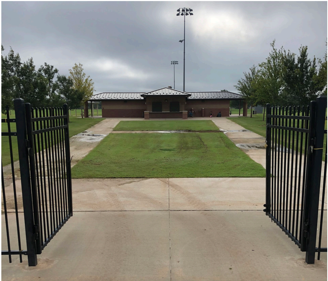
Image 1: The entrance to the soccer fields and office/concession building at the Sports Complex

The exterior sculpture sought through this announcement will be designed for and installed on the lawn between the main entrance gates of the Sports Complex and the concession/office building.