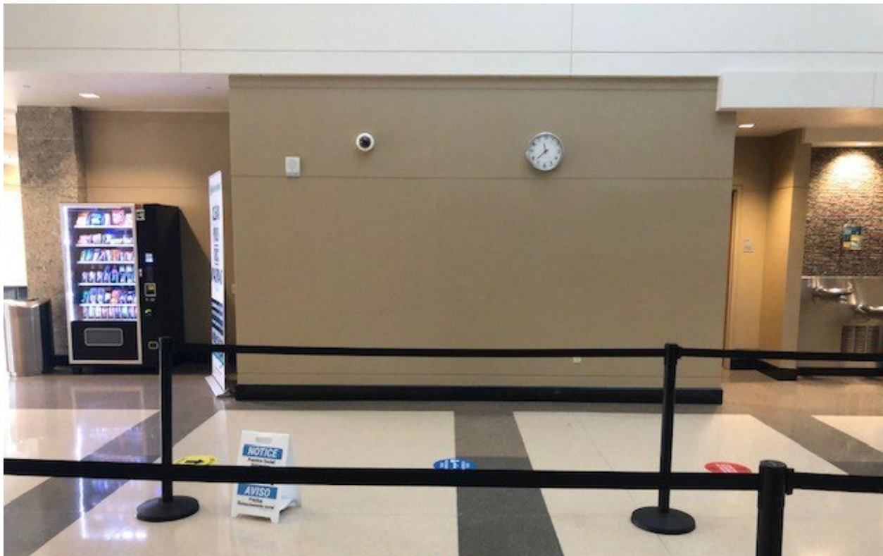
Image 1: Lobby of the Oklahoma City Municipal Court Building at 701 Couch Drive

The artwork sought through this call to artists is an installation consisting of both functional and non-functional works of art. The installation will be focused on the west wall of the lobby and will include a sculptural table or group of tables to serve as surfaces for writing, and 2D or 3D art for the wall or adjacent walls. The installation may also include sculptural lighting or other functional art elements that may be proposed by Finalists.