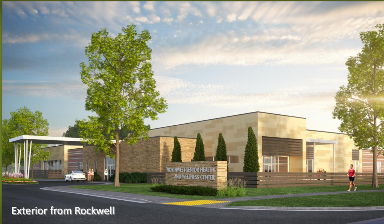
Exterior from Rockwell