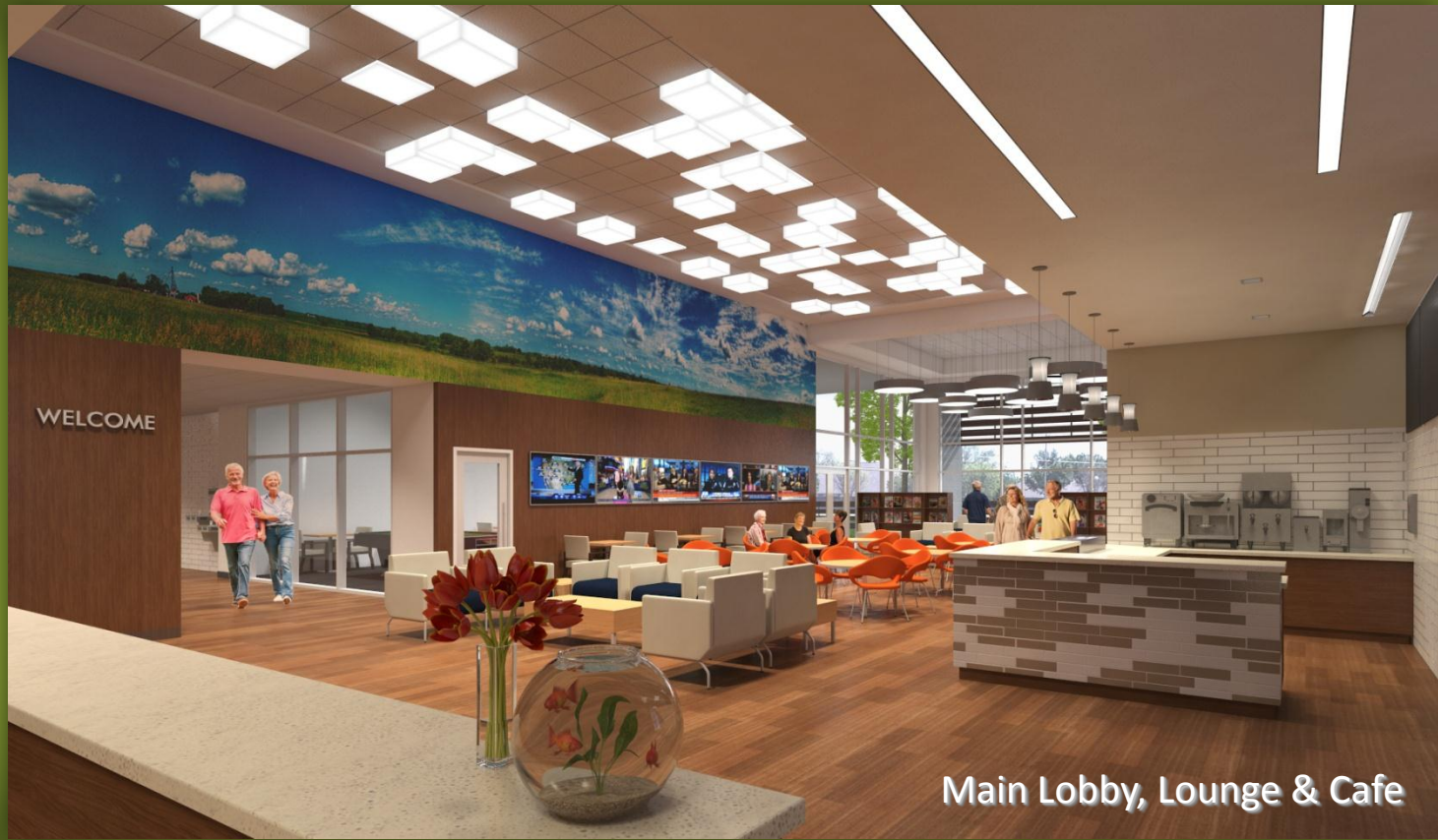
Main Lobby, Lounge & Cafe