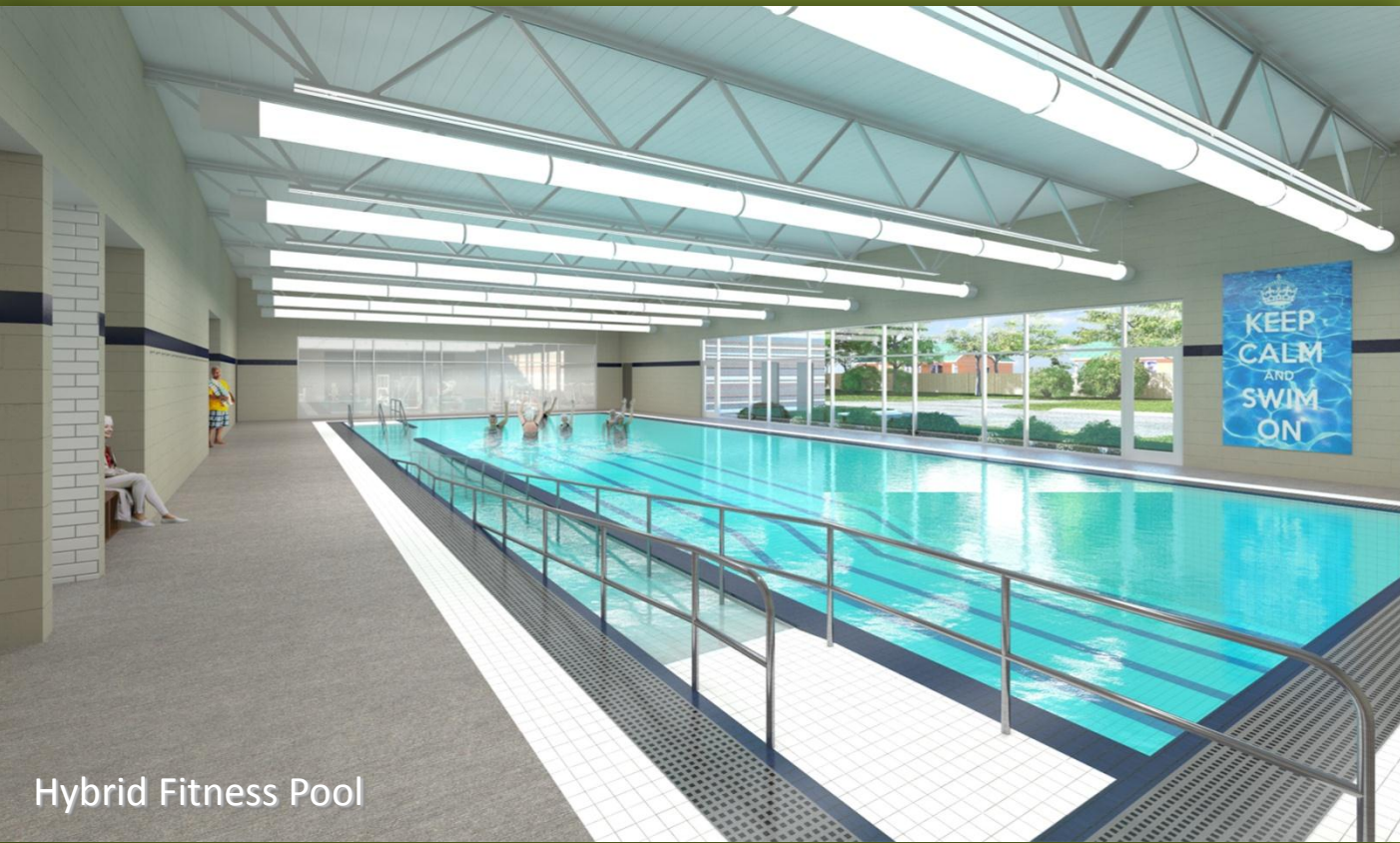
Hybrid Fitness Pool