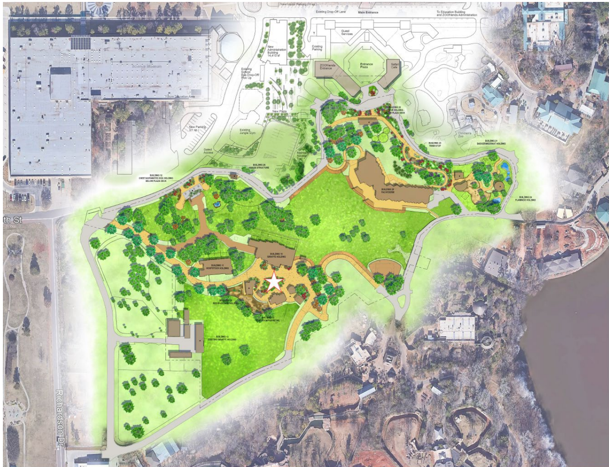
Figure 2 Concept Rendering provided by Peckham, Guyton, Albers & Viets, Inc.

The exterior public artwork sought through this announcement will be designed for and installed at the Zoo Orientation Plaza at the center of its Africa-Themed Savannah Exhibits. The work sought will be an extraordinary focal point reflecting the type of animalia typically found on the Savannah in Africa. The work will unite and strengthen the theme for the exhibition site and may be designed and fabricated using bronze, other metals, stone, or any variety of materials suitable for harsh outdoor environments and Oklahoma weather that includes strong winds, high temperatures, hail, and other extremes. Construction is currently underway with completion anticipated in November 2022.