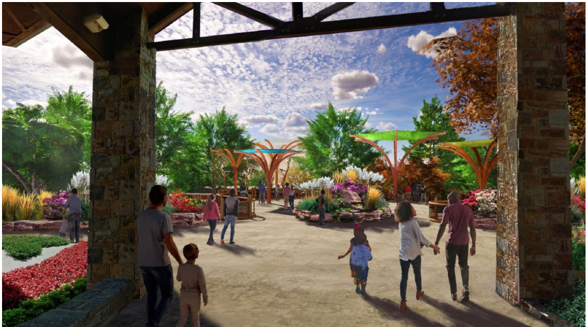
Figure 1: Concept Rendering by Peckham Guyton Albers & Viets, Inc.

4:00:00 p.m. CST Wednesday, November 10, 2021