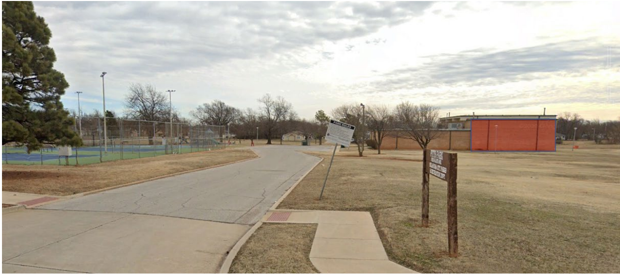
Figures 2 (above) and 3 (below: Pitts Park Recreation Center (shaded rectangle); indicates location for mural.