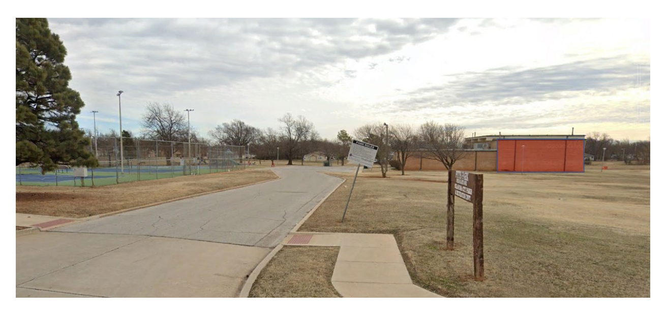
Figures 2 (above) and 3 (below: Pitts Park Recreation Center (shaded rectangle); indicates location for mural.