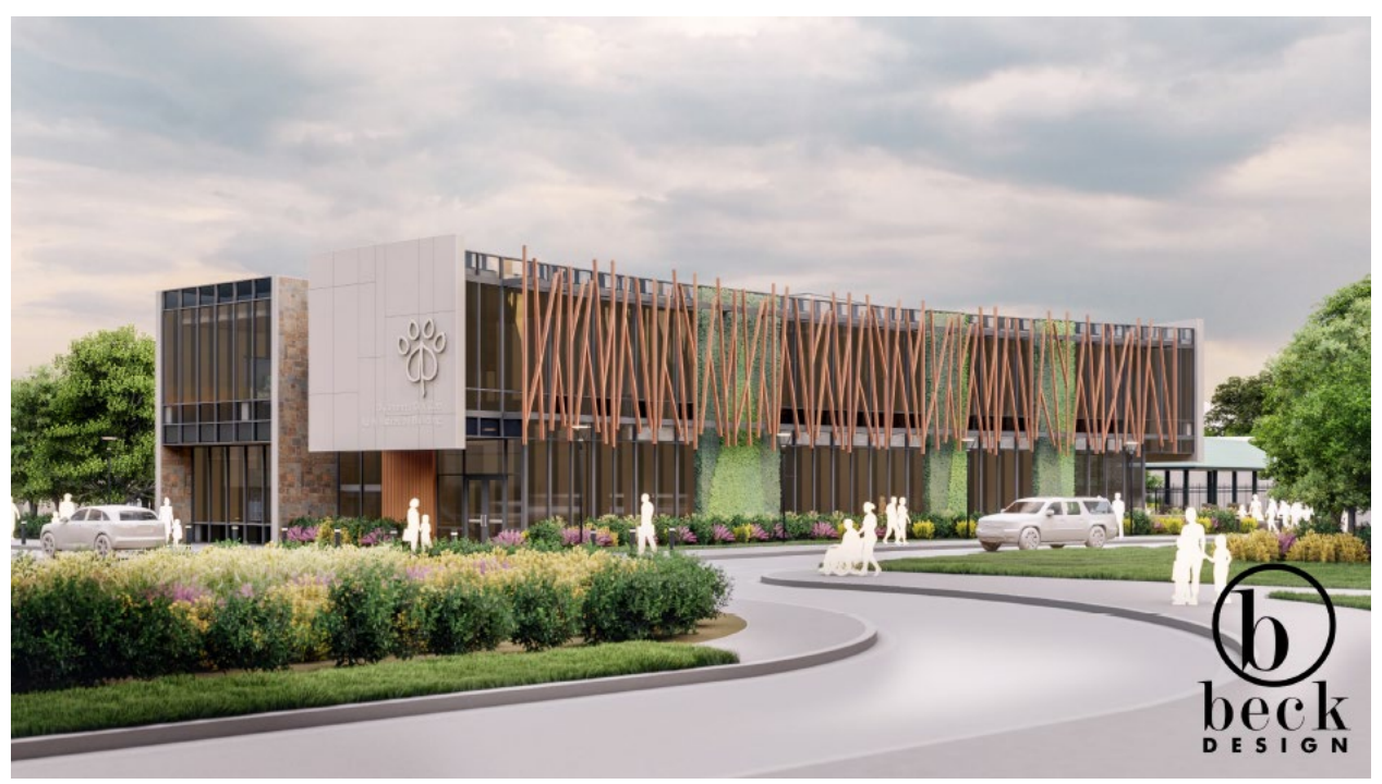
Figure 1: Concept Rendering. This and all illustrations by Beck Design

4:00:00 p.m. CDT Wednesday, March 16, 2022