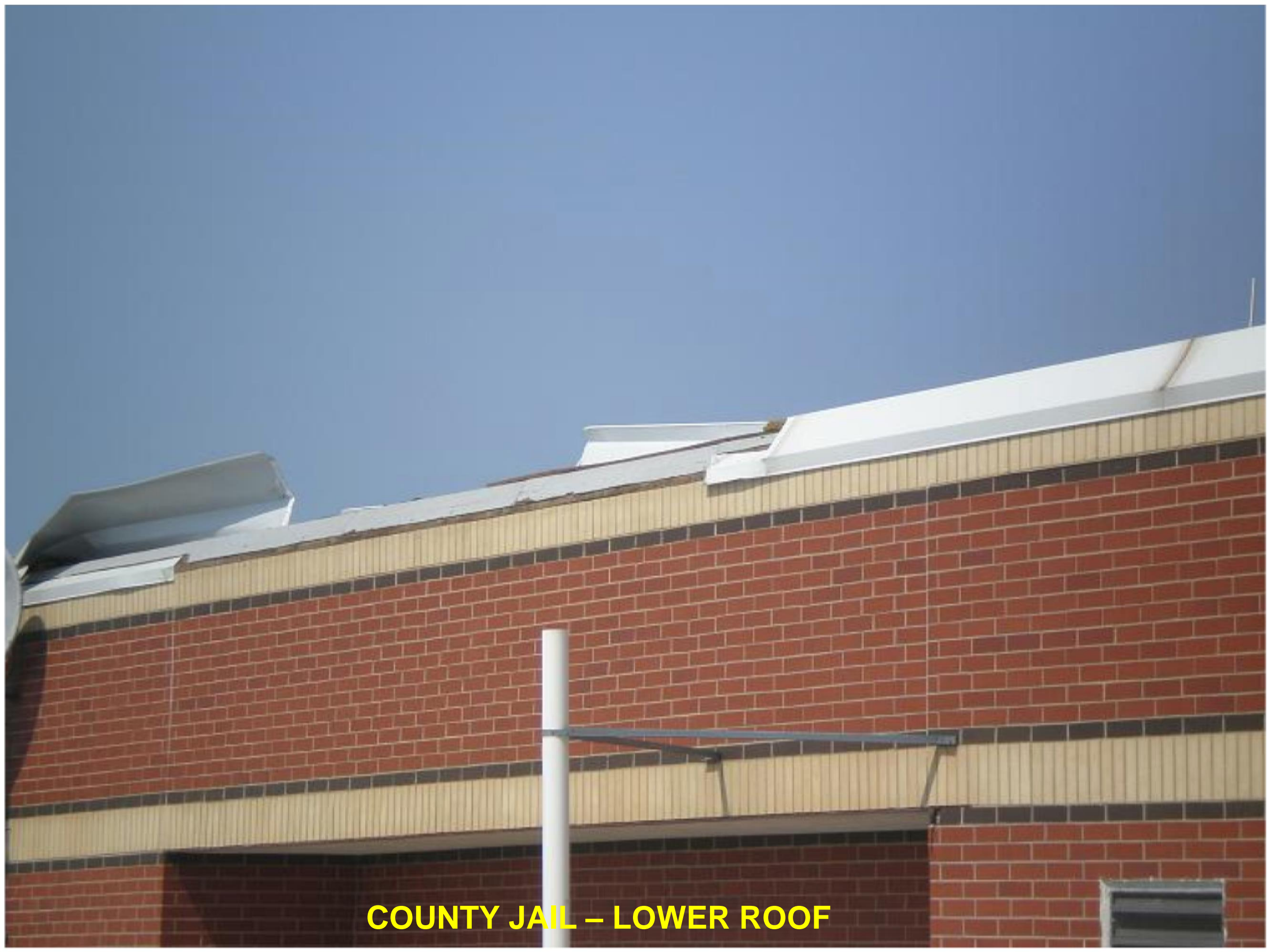
COUNTY JAIL – LOWER ROOF