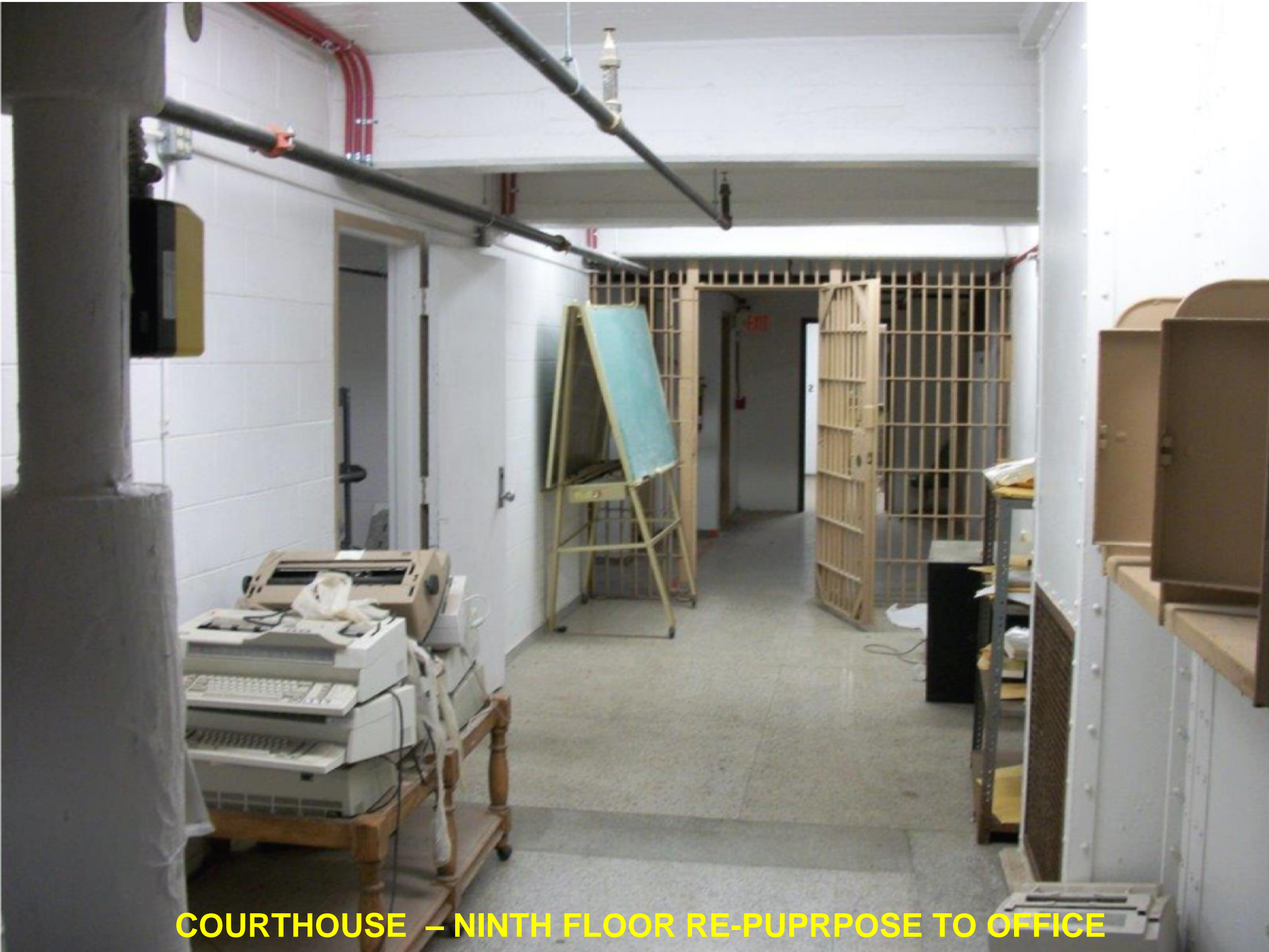
COURTHOUSE – NINTH FLOOR RE-PUPRPOSE TO OFFICE