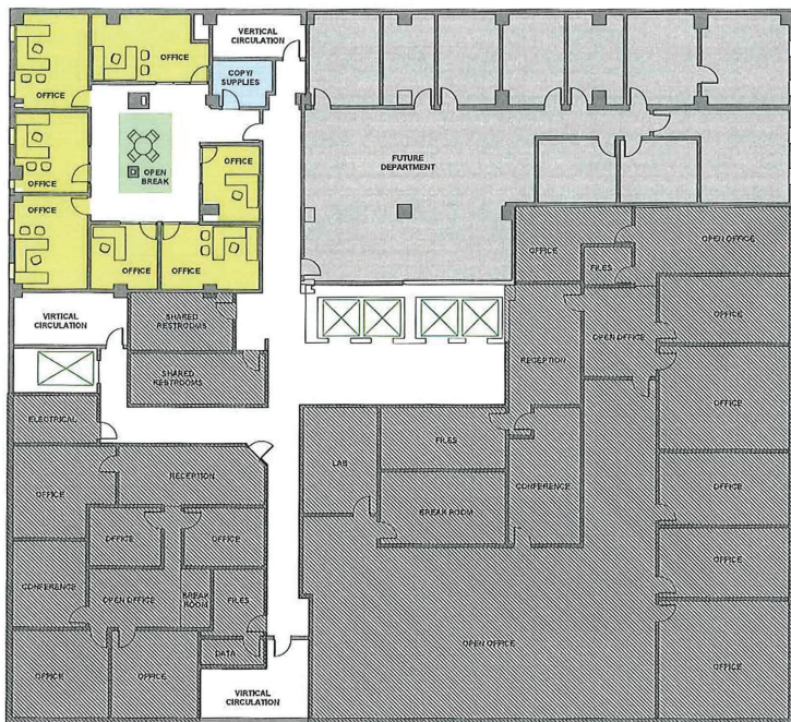
3 FLOOR 03 - OPTION (B) 1/8" = 1'-0"

Area highlighted in yellow below to be demolished and remodeled.