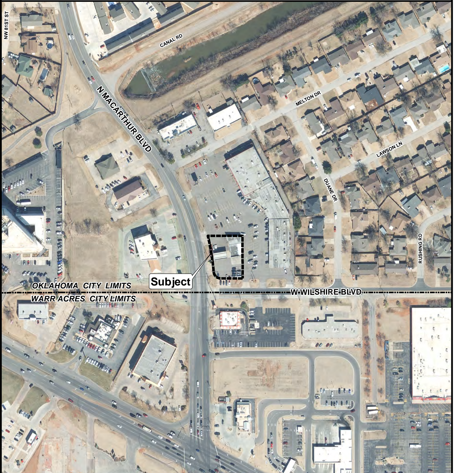
Aerial Photo from 2/2022

Case No: SPUD-1663 Applicant: Nin Lo Existing Zoning: SPUD-79 Location: 7900 N. MacArthur Blvd.