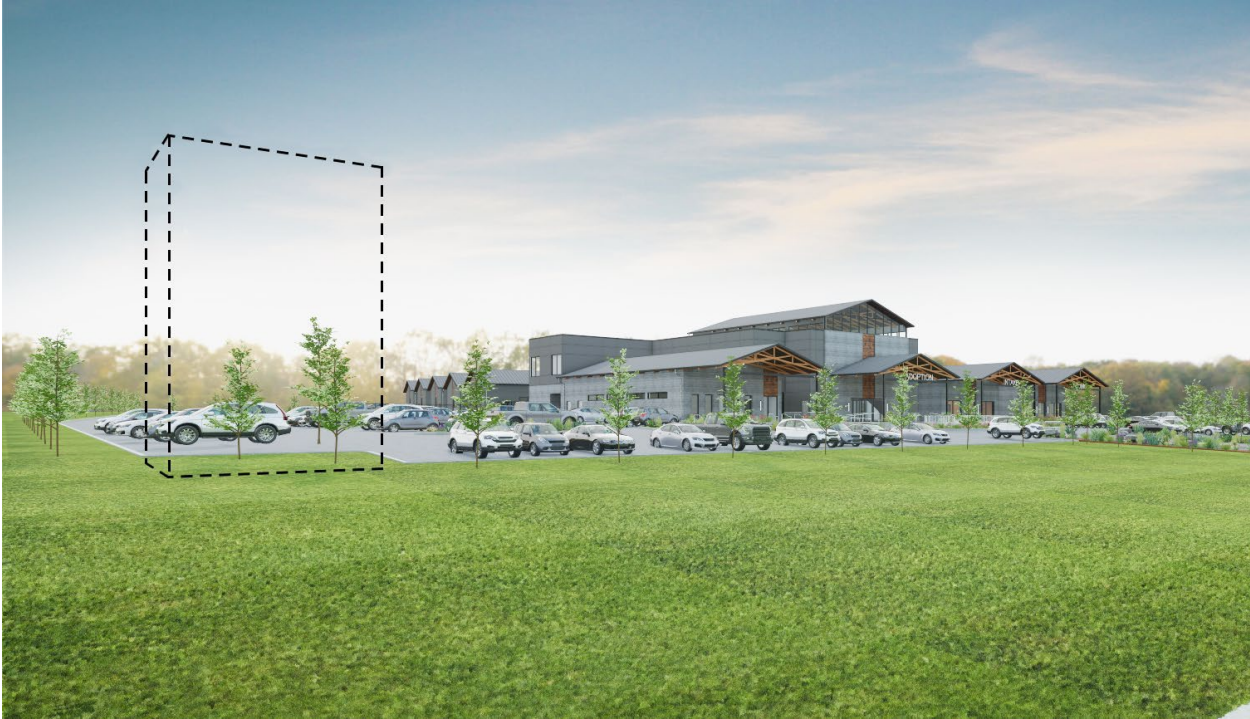
Image 1: Exterior view of the Animal Welfare facility. Dotted lines indicate the location of the Art

The 1% for Art funds for this project will be used to enhance the mission of Animal Welfare. The artwork for this RFQ will be a large and impactful 3-Dimensional sculptural installation located immediately to the south of the new facility on 400 sq ft installation space. The artwork should communicate and reflect OKC Animal Welfare’s mission to promote and protect the health, safety, and welfare of pets and people in Oklahoma City, as well as representing and reflecting Animal Welfare’s diverse population of animals while effectively illustrating the Human-Animal bond.