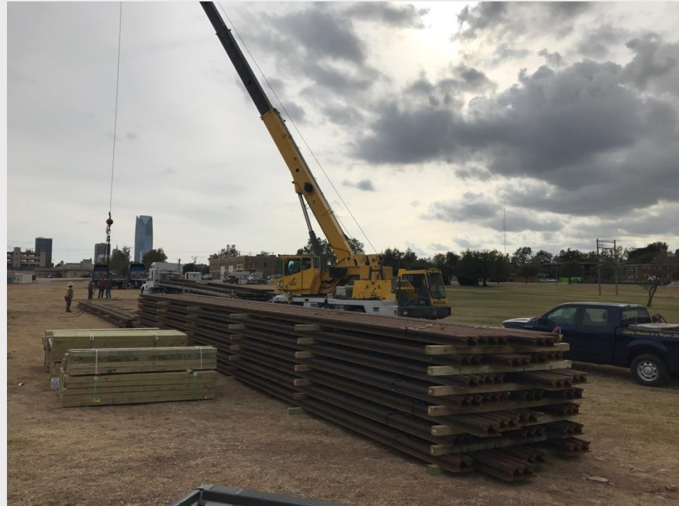
Rail Arriving near NW 16 th St. and Broadway Ave.